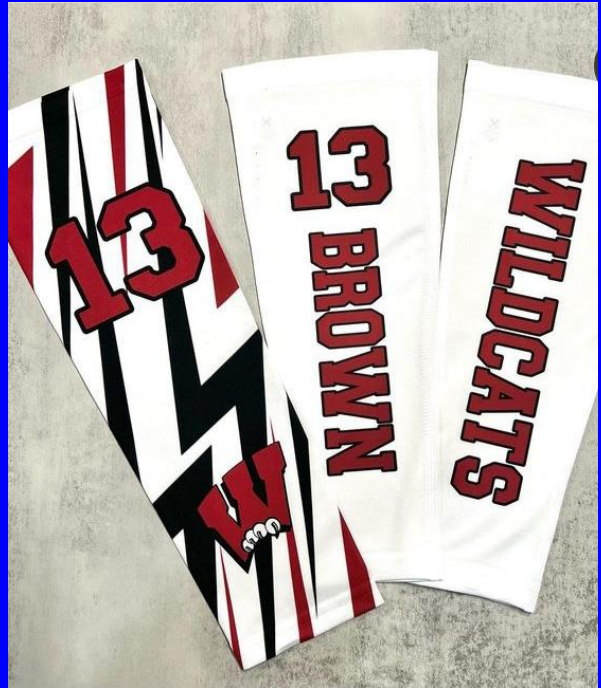
No Boundaries Athletics - Ashton Brown 13 Collection